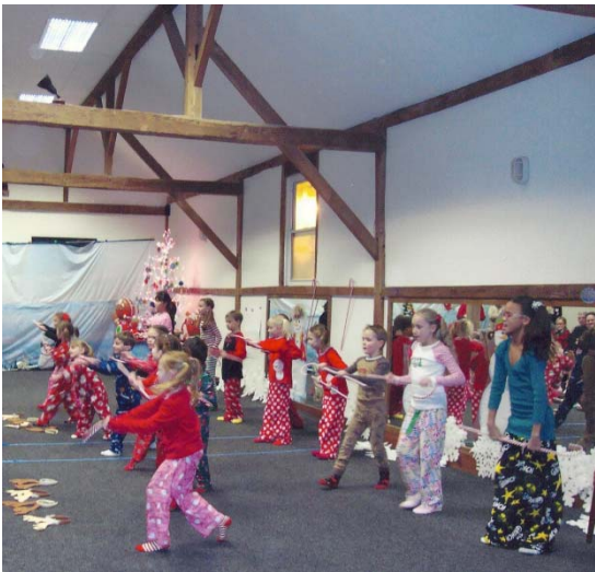
Pictured above: B/A Club and Kindergarten students during their Holiday presentation.